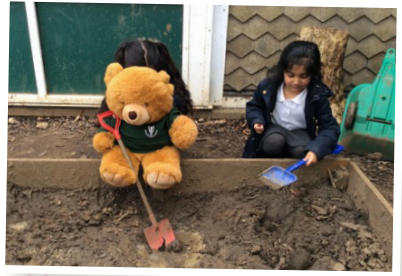
Dig in the digging area