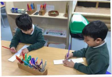
Write and colour.