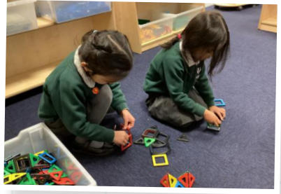
Play with magnet tiles.