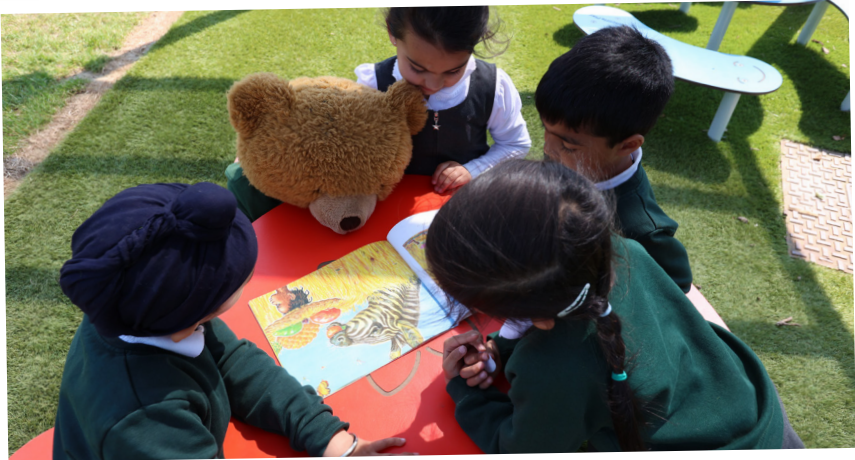
Read a story together