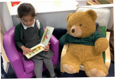
Read a book.