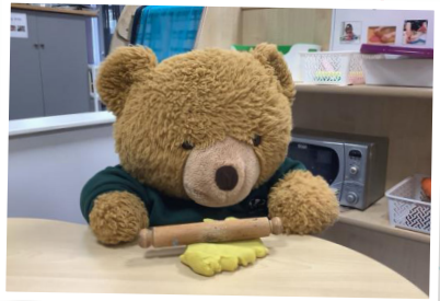
Play with playdough.