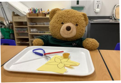
Make things at the creative table.