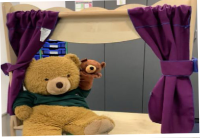
Make up stories at the puppet show.

Here are some of the fun things we can do in our classroom.