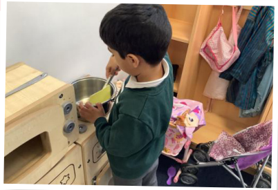
Play in the home corner.