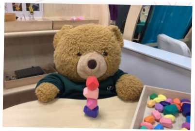
Play in our funky finger area.