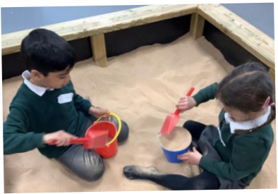
Play in the sand pit.