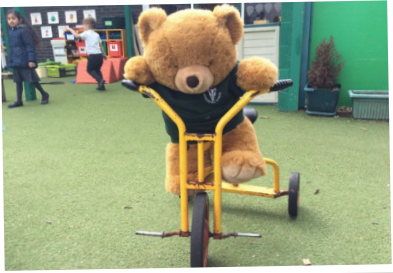
Share the bikes