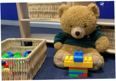
Build with blocks.