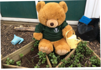
Grow plants in the garden