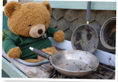
Cook in the mud kitchen